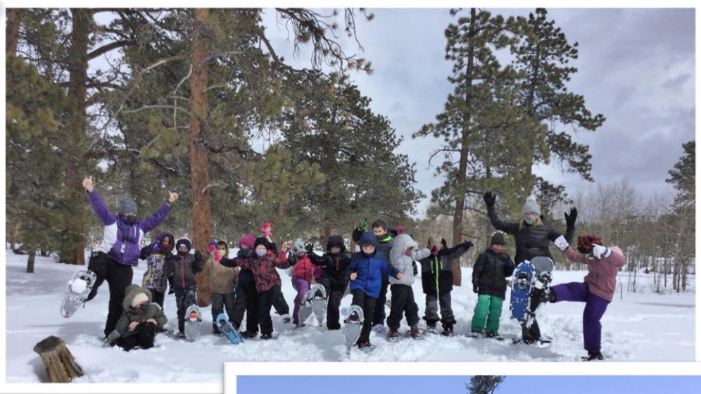
K/1 and 2/3 enjoy an afternoon of snowshoeing